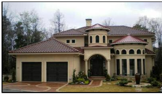
La Scala Court